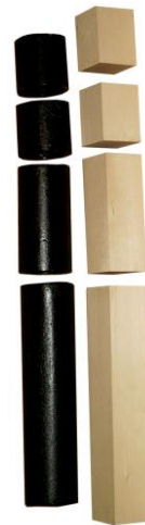
Art. 035 Iron and wood elements for Flinder's plank