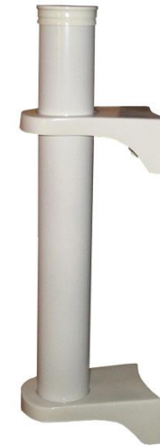
Art. 036 Supports with tube for Flinder's plank