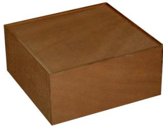
Art. 031 Wooden case for spare compass.