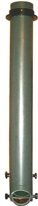
Art. 034 Optical tube for reflection binnacle mod. FF2, extensible to max. 150 mm.