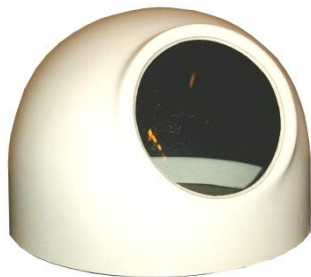
Art. 032 Protection dome with port-hole for Binnacle mod. FF2.